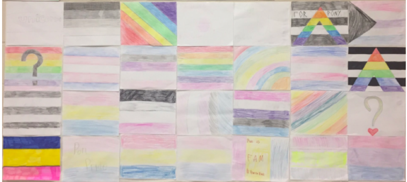
Figure 1. Compilation pride flag colored by GSA students.

Because of the issues the previous year, I took a photo of the finished flag (Figure 1) and sent it to the principal for approval prior to hanging. Once we had that approval, it went up in a large blank space of the math hallway (somewhere we knew all students would pass at some point in their day). Two days later, my colleague and I were asked to meet with the principal during our lunch period. I felt sick to my stomach because I knew what the outcome of that meeting would be—the flag was coming down.