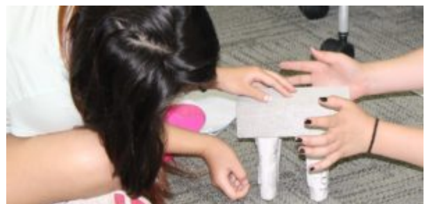
Students work on a newspaper support structure challenge to learn about the four phases of engineering.