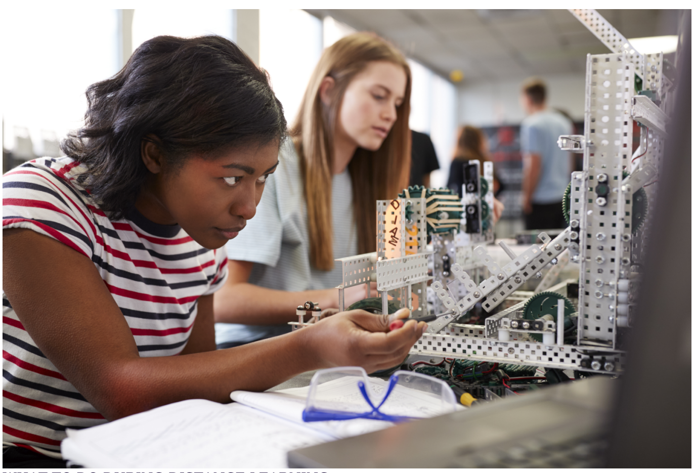
WHAT TO DO DURING DISTANCE LEARNING

Thirty-five minutes, twice a week via Google Meets that students were not strictly required to attend. That was all. Like many districts, mine had to scramble in the fall of 2020 to reinvent school and that was "class" for my students most of the 2020-2021 school year. In my context, which is a large, diverse urban school, we quickly learned that online learning presented many barriers for students as far as attending and engaging in short synchronous class sessions. Since fewer than half my students attended, I could not provide equitable access to physics content during those classes. Because of this, I shifted all instruction to asynchronous materials like readings and videos, which left all of our synchronous class time open for discussions. This left me without much to do during class, but also created a space where I would have the freedom to explore something I knew was important to both myself and students: issues related to social justice. I made the decision early on not only to provide the same 10 or so students who came to class with the chance to explore social justice topics, but all students. Many of our synchronous activities were done in a way that students could participate after the fact using different digital tools. Students were able to share ideas in discussion posts, Flipgrid videos, and Padlet posts centered around the same