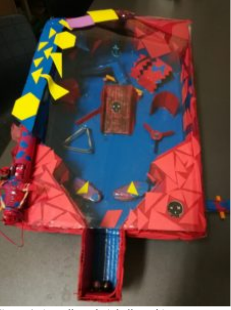
Figure 1. A cardboard pinball machine constructed by a student.

Marna incorporated a set of student-chosen science fair investigations about the forces in rubber bands, angles of ramp elevation, and friction on different surfaces.