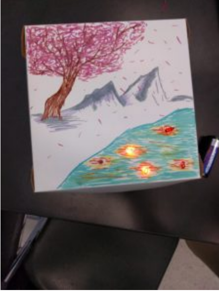
Figure 2. A student prototype of their electric art project completed in a small cardboard box (above) and a final project completed on a canvas with lights not yet installed (below).