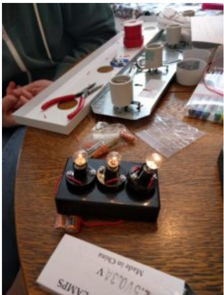
Figure 3. Testing a mystery circuit during one of our meetings.

We prototyped various smaller activities throughout the year, including: